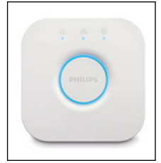
LETMSC19001 Phillip Hue Bridge (NOT included ~ Available for purchase)