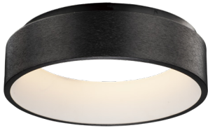
E31252-BBK Flush Mount

Job Name : _____ Job Type : _____ Quantity : _____ Comments : _____