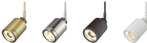
aged brass satin nickel antique bronze white