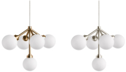
frost / aged brass frost / satin nickel