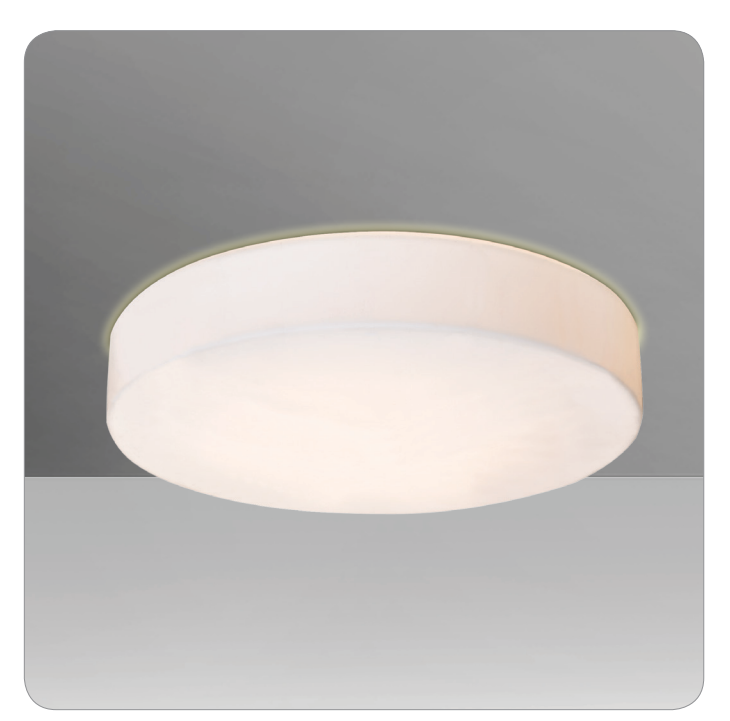
OPAL MATTE (PRIDE1407C)

All dimensions provided are nominal. Allowance must be made for dimensional tolerance in handcrafted glasses.